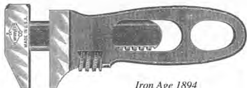
Iron Age 1894

By 1912, the company was offering a variety of BULLDOG alligator wrenches identical to the line previously made by the AMERICAN SAW CO., the ALWAYS READY twin alligator wrench previously made by the PORTLAND WRENCH CO., and the BULL TERRIER twin alligator wrench. About 1920 the monkey wrench lines were taken over by J.H. WILLIAMS & CO., which sold them under the W & B name. (Illustrations continued on next four pages)